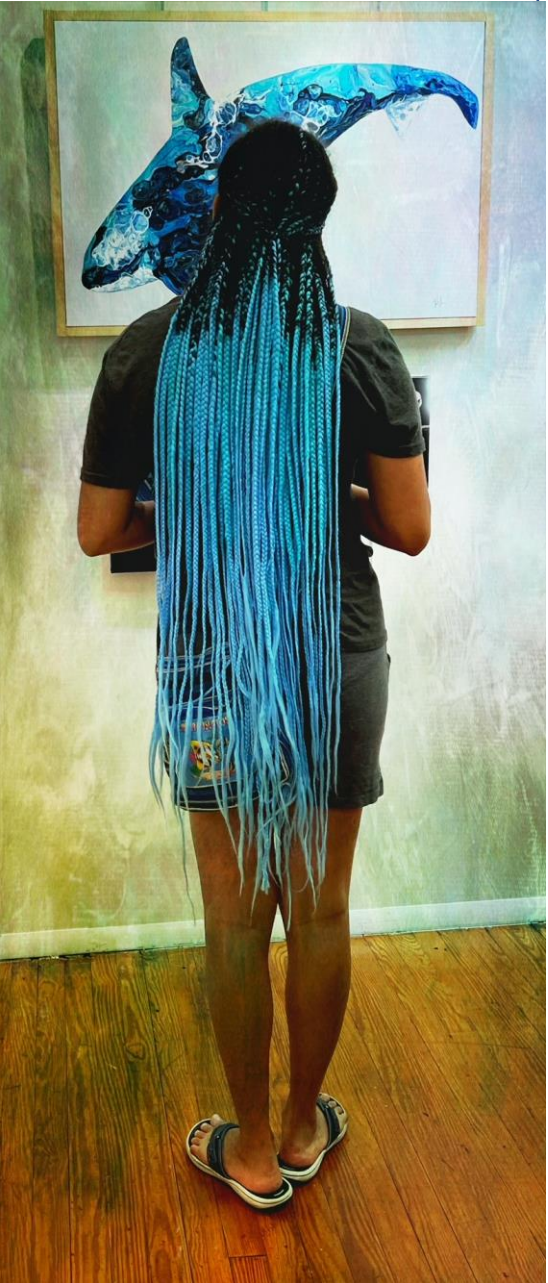
2<sup>Nd</sup> Place - "Girl Viewing Orca Painting by Haley Light"