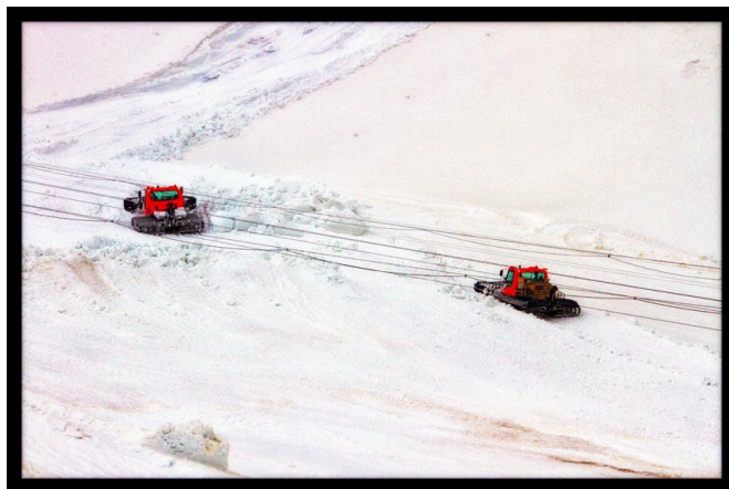
Snowplows on Zugspitze - Germany