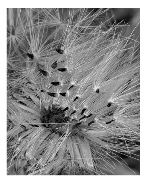
"To the Sky"