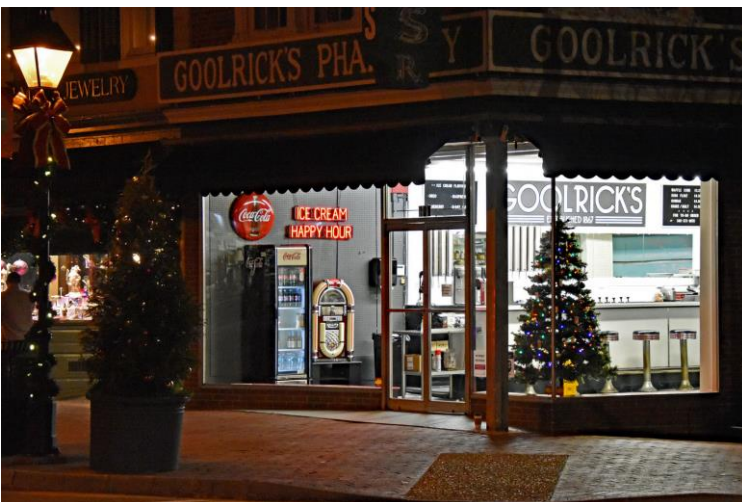
Life in Virginia – Seasonal Goolrick's