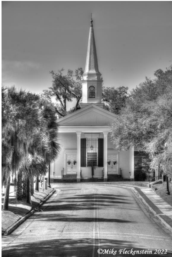
Kingston Baptist Church, Conway SC