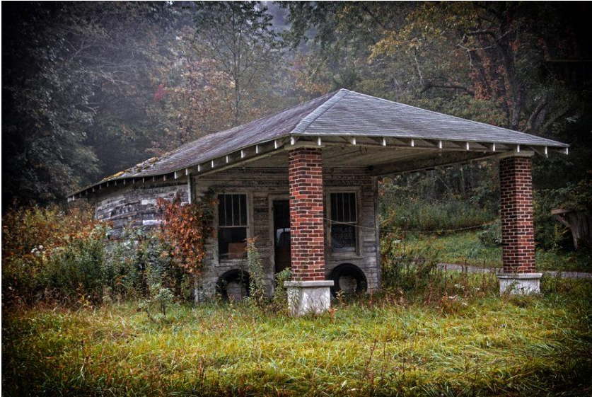
Abandoned store in rural southwest Virginia.