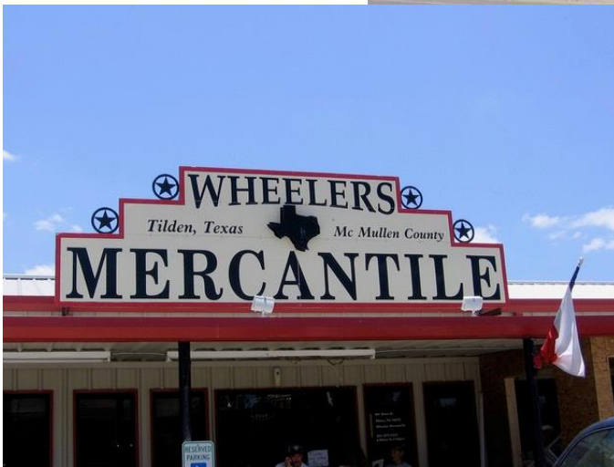
The One Gas Station