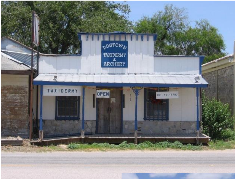
The One Taxidermist

All photos taken in the small town of Tilden, Texas