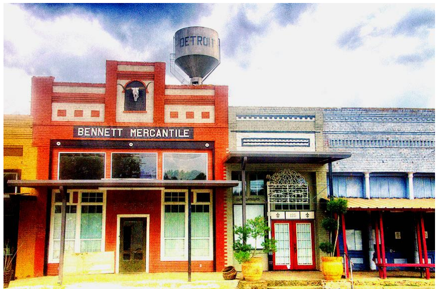
Main Street Detroit TX