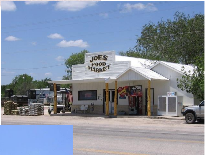
The Only Food Market